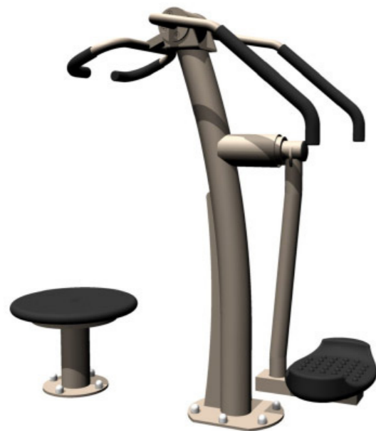
PENDULUM AND TWISTER (CROSS TRAINER/SKIER)