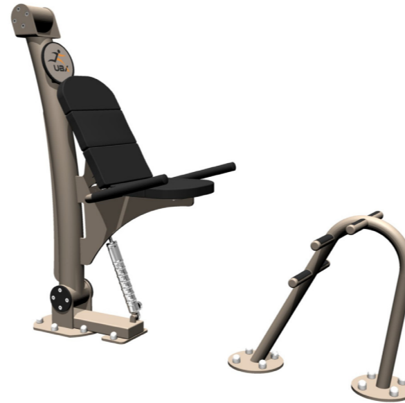
LEG PRESS (DOUBLE LEG PRESS)