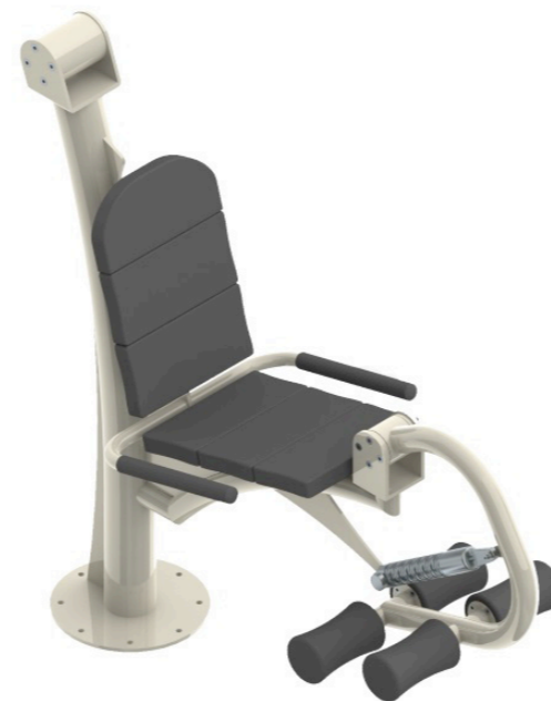
LEG EXTENSION (DOUBLE LEG PRESS)