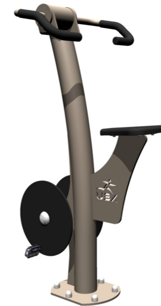
BICYCLE (RECUMBENT BIKE)