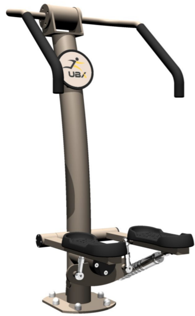
STEPPER (AIR WALKER)