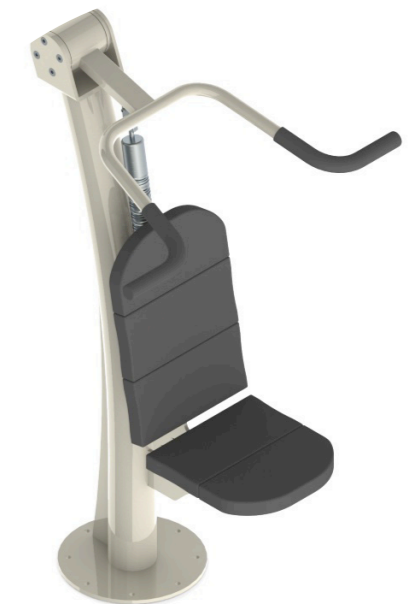
HIGH PULLEY (LAT PULL DOWN)