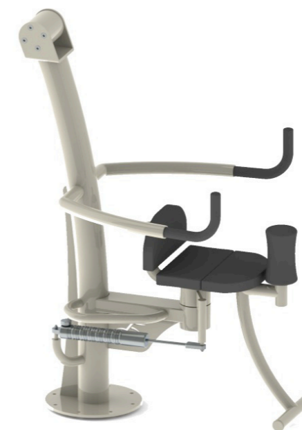
HIP TWISTER (OBLIQUE TRAINER)